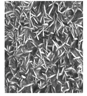
Ni Flash CRS